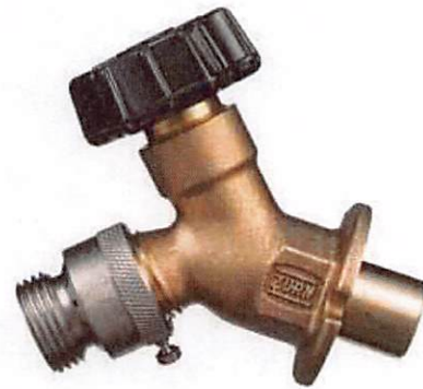
Hose Bibb on outside faucet

Customer shut off will attach after this point